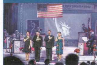
ALL HANDS ON DECK