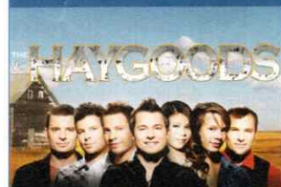
THE HAYGOODS SHOW